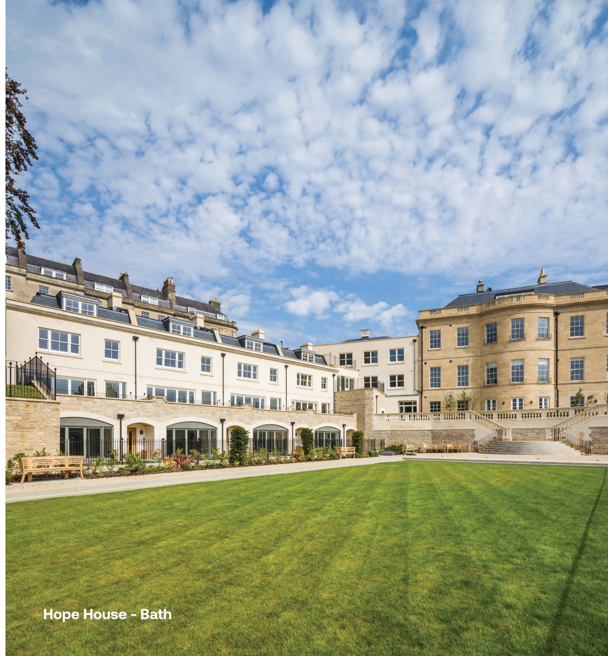
Hope House - Bath